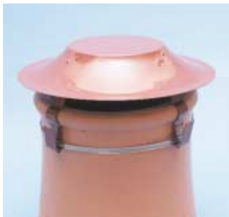
RAIN JAMMER The easy way to cap chimney pots