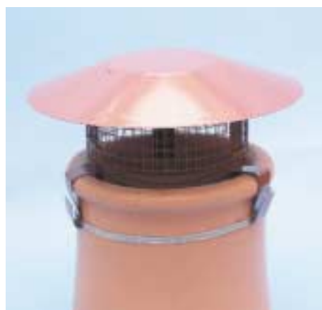
BIRD JAMMER with clip The Terminal for all systems