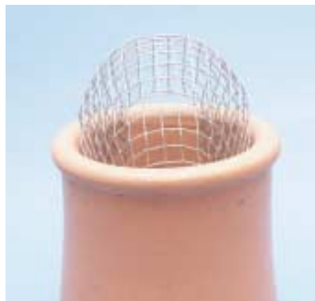
WIRE JAMMER The wire balloon bird guard for all pots

All the above terminals except the WIRE are powder coated terracotta as standard. They can also be coloured to your specification as a special but will incur an extra charge.