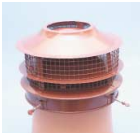
WIND JAMMER MK II The supreme anti-down draught terminal

A CLIP ARRANGEMENT CAN BE SUPPLIED FOR THE WIND JAMMER FOR EXTRA SECURITY