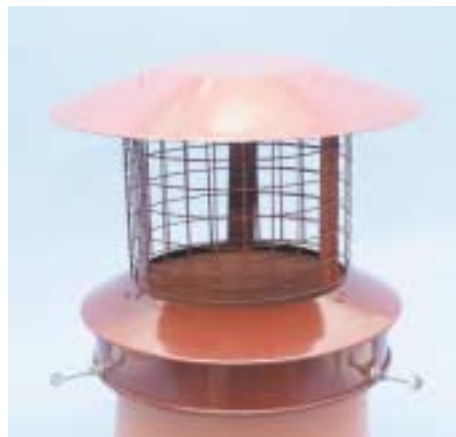
BIRD JAMMER with collar SF The easy fitting Terminal for Solid Fuel